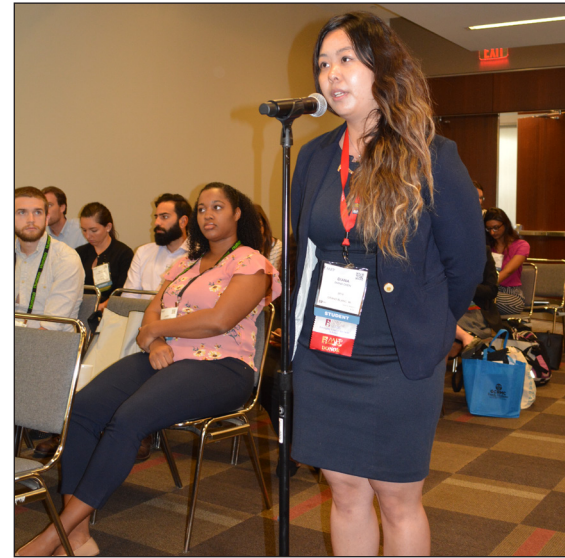
National Congress Reference Committee Hearing

Family Medicine Leads Emerging Leader Institute | Member Interest Groups | Board review preparation resources (free for AAFP members) | The Match and residency interview preparation resources | Networking | Scholarships and awards ... and more! aafp.org/medical-school-residency/student-resources.html